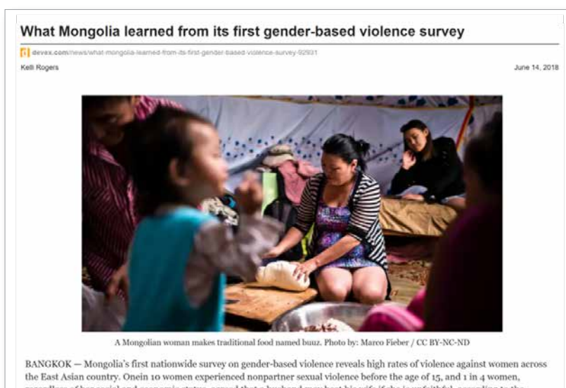
FIGURE 5: Article about the 2017 VAW Study on Devex