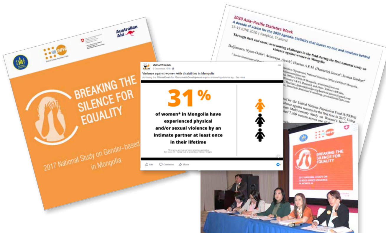
FIGURE 6: Dissemination activities for the 2017 VAW Study in Mongolia 15