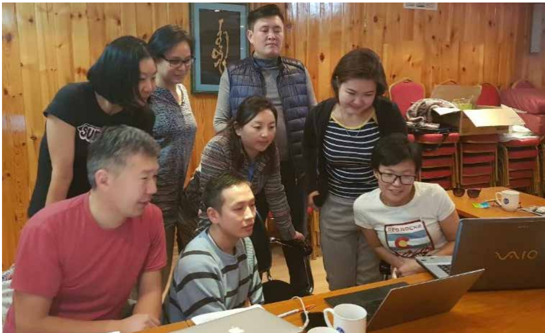
FIGURE 4: The NSO Study Team begins work on the analysis and write up, November 2017

English was used as the working language for the draft report to enable regular review by the technical advisors from UNFPA. Most of the NSO team preferred to do their initial work in Mongolian and then translate it into English for expert review. For efficiency and quality control, including reviews by the international experts, this needed to be adjusted and work on the English version needed to be prioritized with different persons in charge of and managing the two language versions. A small team of UNFPA translation experts helped by cross-checking the translations. Working in two languages added a layer of complexity, and version control presented challenges throughout the drafting and review processes.