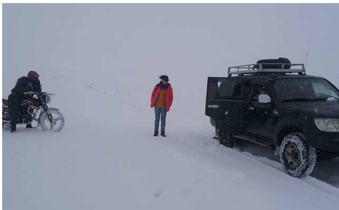
FIGURE 3: Interviewer gets help from a local to find an address

There were some barriers when collecting the data. It was difficult to pass through the mountains and the rivers in the vast countryside of Mongolia. To get to the household selected in the survey, interview teams had to go through rivers without bridges, mountains without tunnels, and sand dunes without a road. Sometimes they were helped by the locals to pass those barriers. There were times that they even spent a whole day to reach a family that was only 50 kilometres away.